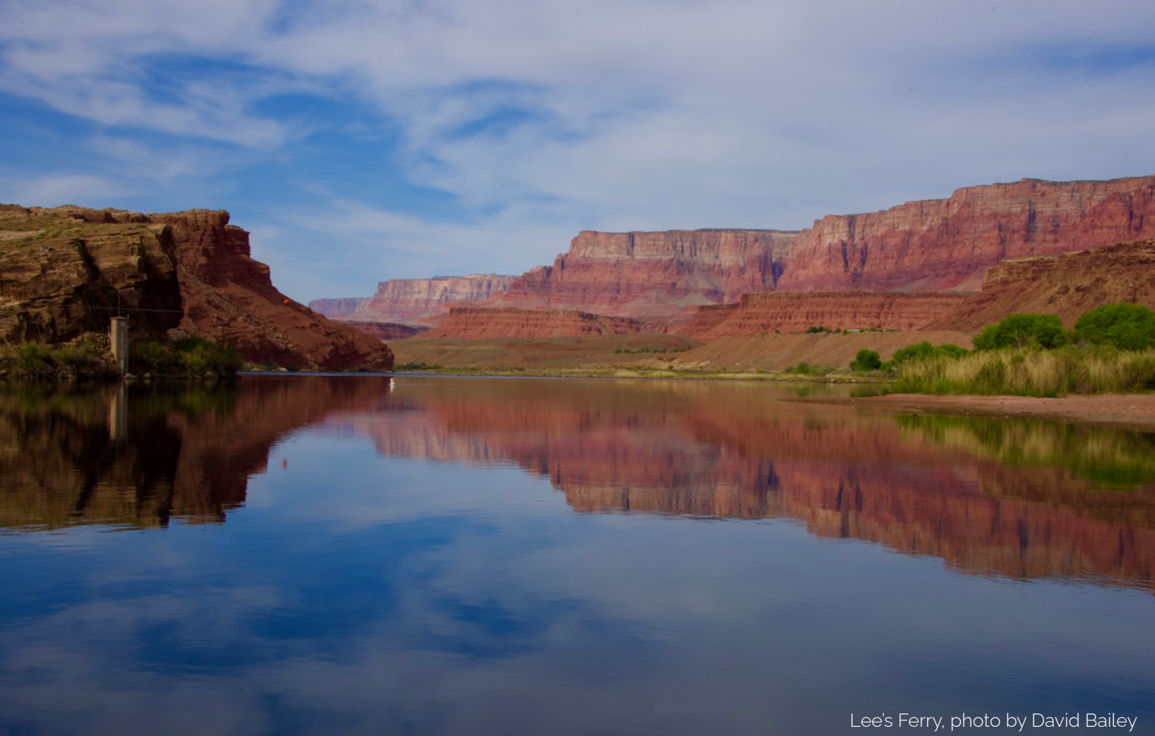
Lee's Ferry