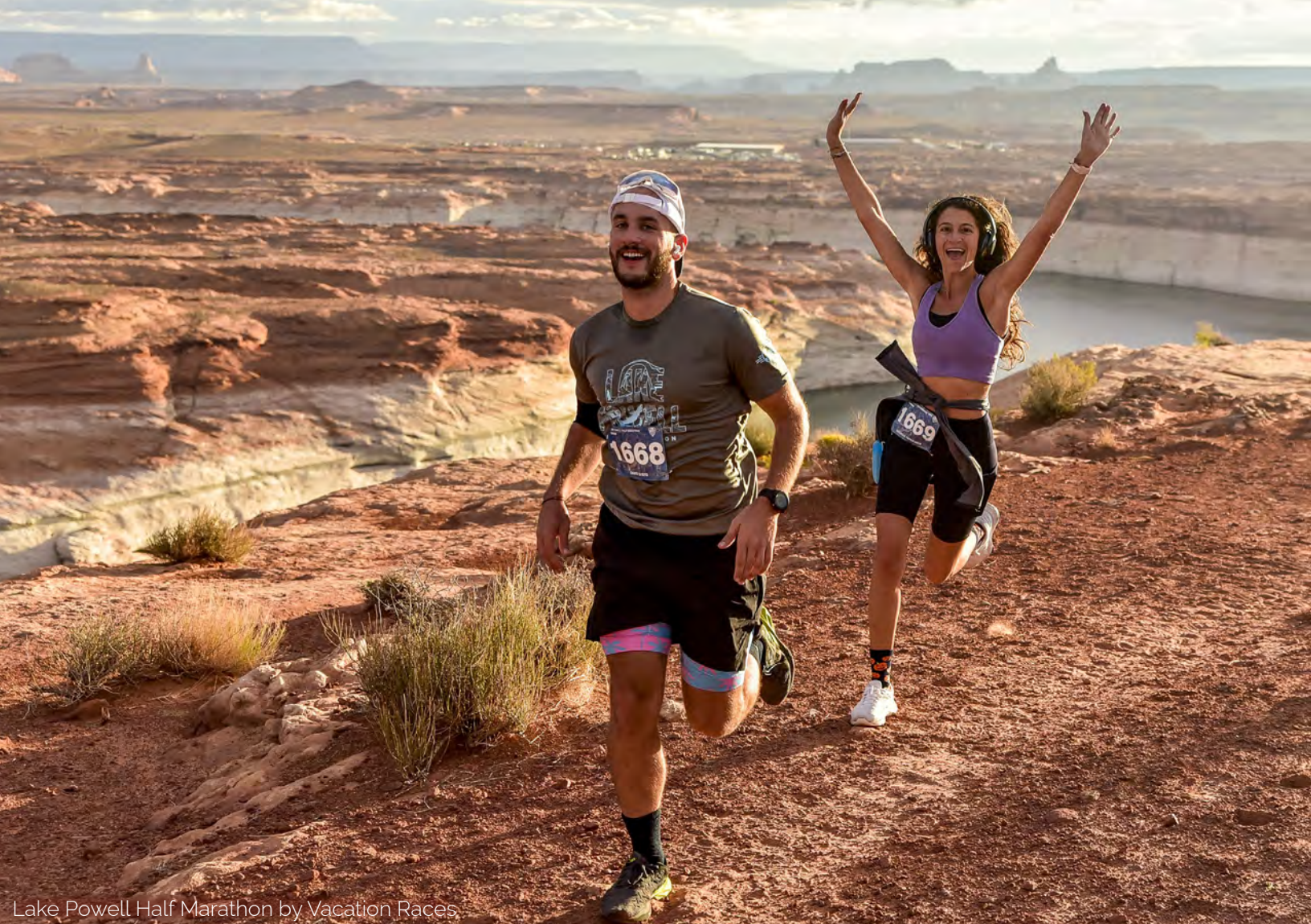
Lake Powell Half Marathon by Vacation Races