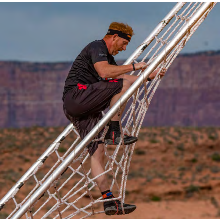
Horseshoe Bend Obstacle Course Race

Challenge yourself by participating in one of our exciting sporting events that incorporate the beautiful landscape to create unique courses.