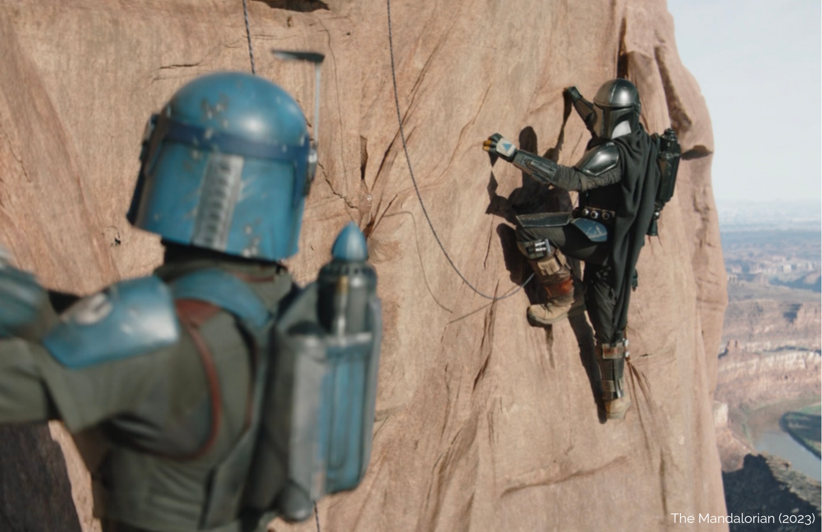
The Mandalorian (2023)