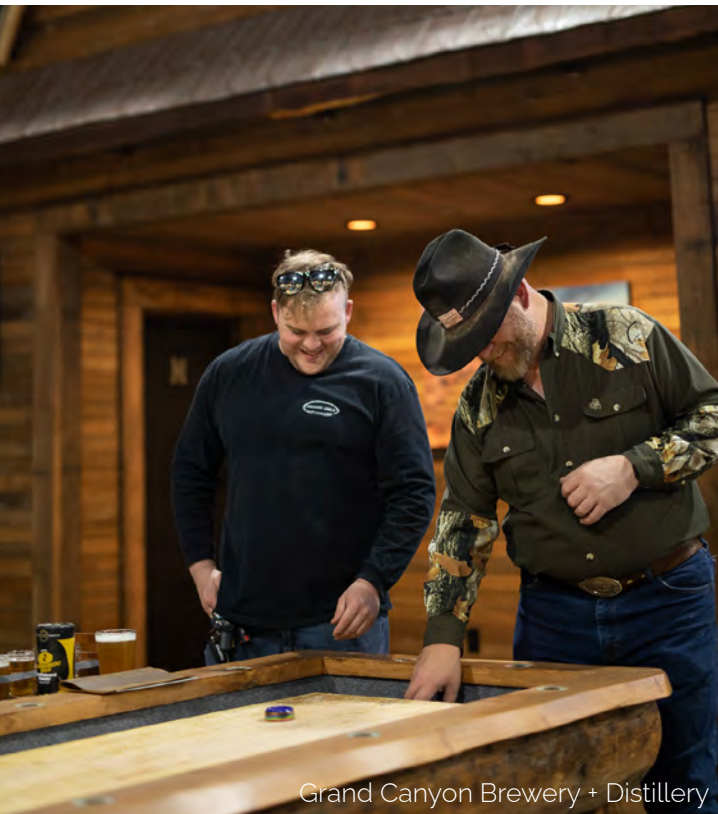
Grand Canyon Brewery + Distillery

Page is full of life when the sun sets. From billiards to unique shows and entertainment, enjoy the eclectic energy you can't find anywhere else. Enjoy a walk in downtown Page after the sunset to experience the colorful and vibrant culture of Arizona.