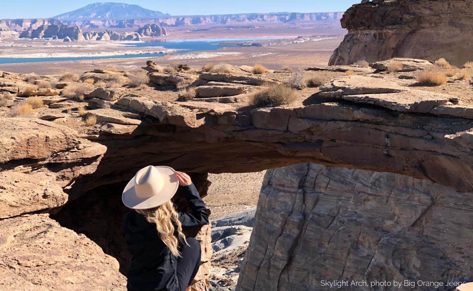
Skylight Arch

Sometimes the trail to scenic views can be rugged, Page has many tour companies that will navigate you through the desert either by land, air, or water.