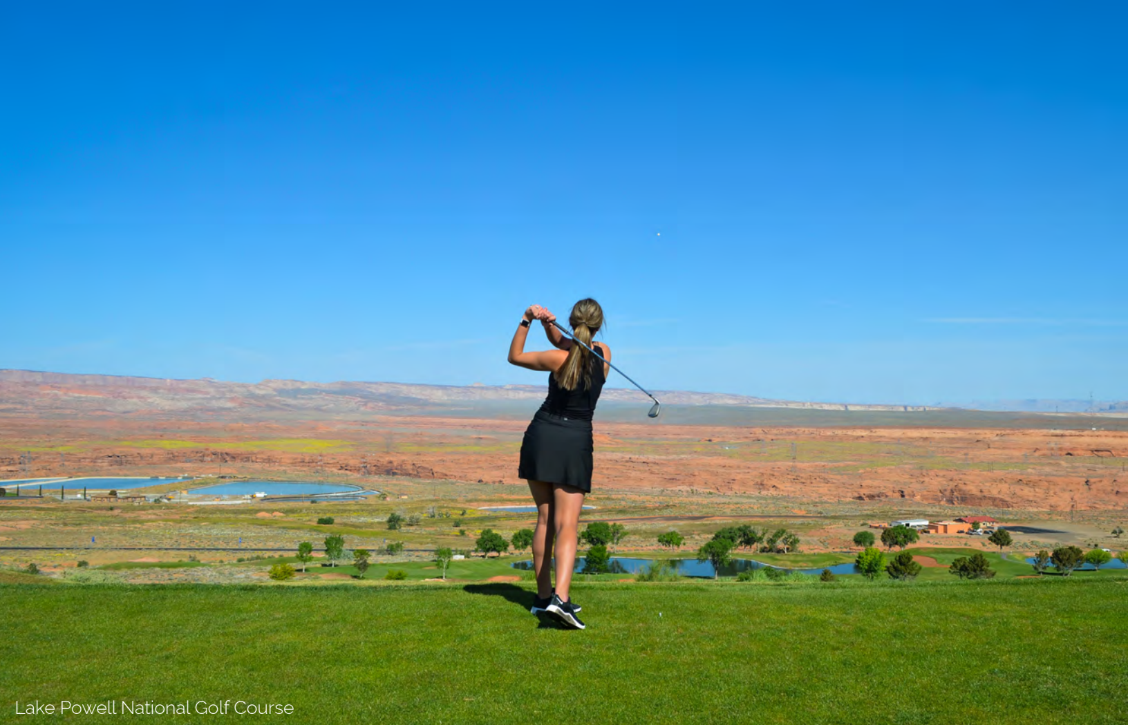
Lake Powell National Golf Course