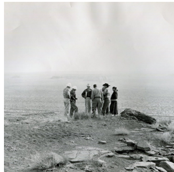
1959, Bureau of Reclamation representatives discuss the Glen Canyon Dam project with local Navajo residents