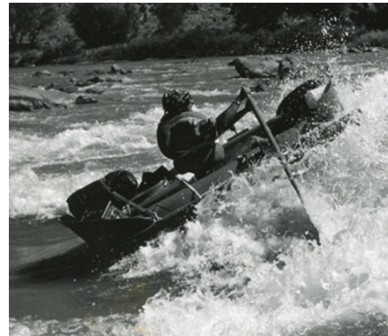
C. 1980, A woman on a sport kayak on the Colorado River

Page is rich in culture and we invite you to learn more about the Navajo culture and enjoy the beautiful natural wonders the area has to offer.