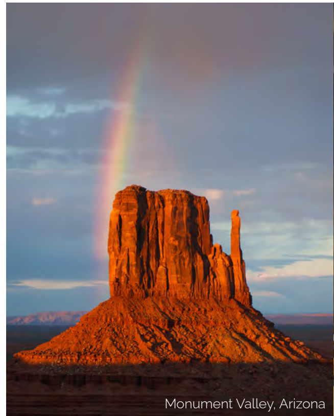
Monument Valley, Arizona