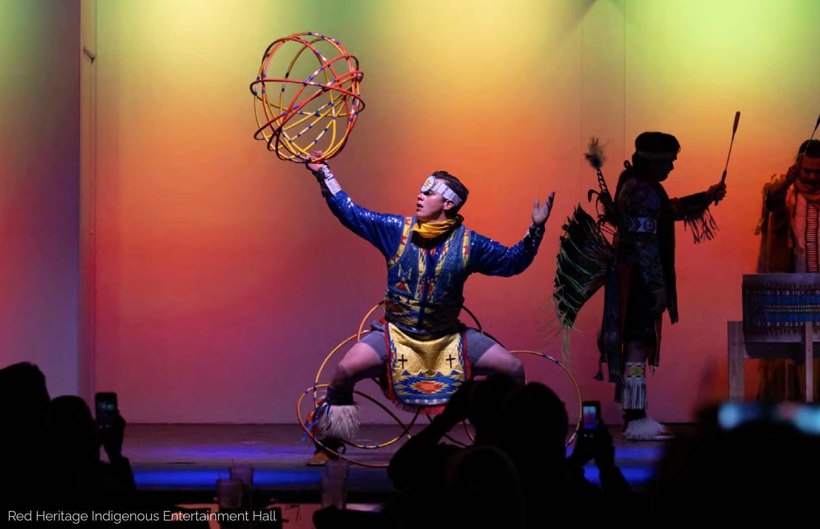
Red Heritage Indigenous Entertainment Hall