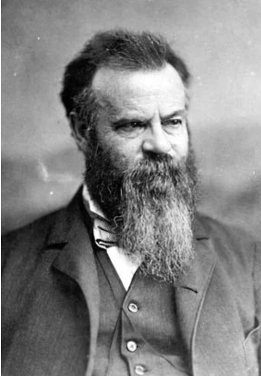
John Wesley Powell

Lake Powell is named after John Wesley Powell. Born March 24, 1834 in New York, Powell was an explorer of the American West. In 1869, the one-armed Civil War veteran led 9 men and 4 boats on the first expedition of the Colorado River. Powell and his men embarked on a journey that covered almost 1,000 miles through the uncharted canyons and fierce rapids of the Colorado River. Powell embarked on a second expedition in 1871 and created the first maps of the area.