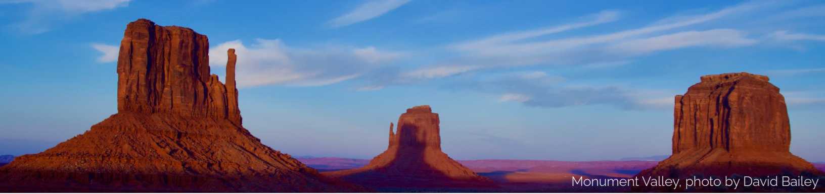
Monument Valley