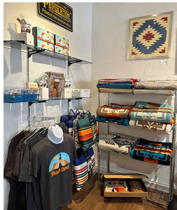
The Page - Lake Powell Hub