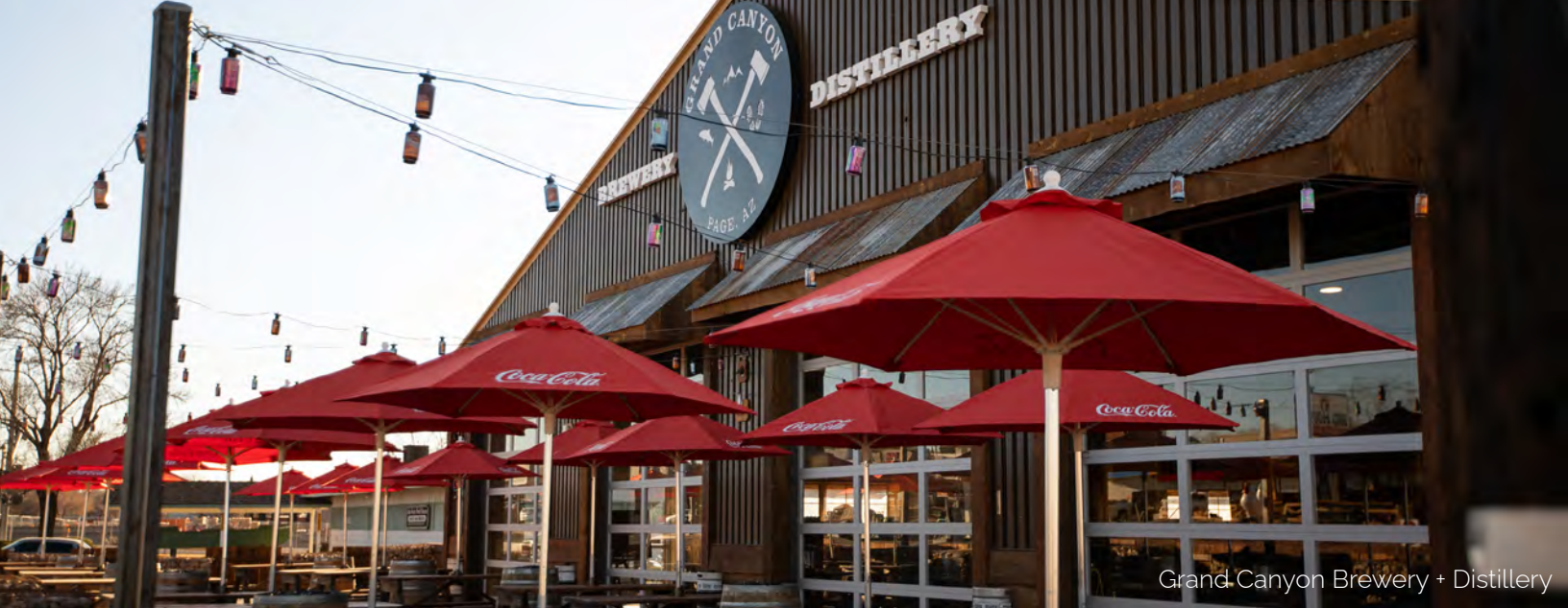
Grand Canyon Brewery + Distillery