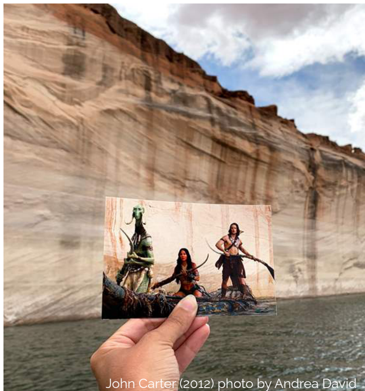
John Carter (2012)