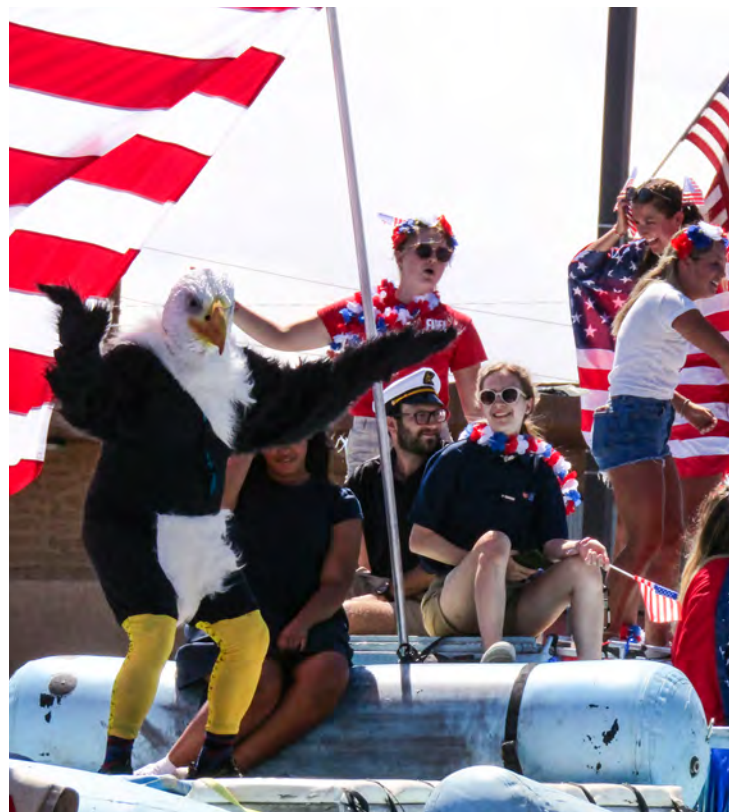
Independence Day Parade