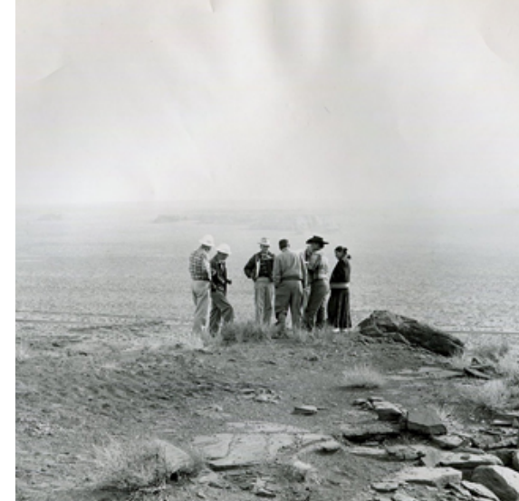
1959, Bureau of Reclamation representatives discuss the Glen Canyon Dam project with local Navajo residents

Page is rich in culture and we invite you to learn more about our history by visiting the Powell Museum & Archives. Opened in 1969, the Powell Museum & Archives showcases a wide range of exhibits covering the history of the area. From paleontology and geology, to the first residents of the plateau and birth of Page, this is the perfect place to immerse yourself in the heart of the The Powell Museum & Archives is located Grand Circle.