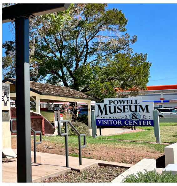
on 6 North Lake Powell Boulevard.