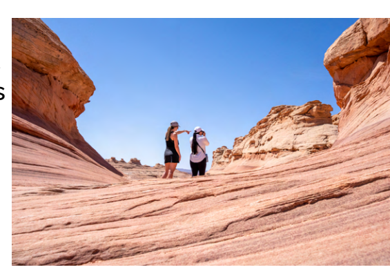
Distance: 1.25 Mi/2.01 Km Round Trip - Elevation Gain: 100 Ft/0.03 Km Difficulty: Easy - Located: Glen Canyon Recreation Area

The New Wave (right) is an easy alternative to if you can't make it to The Wave (above). Just outside of Page, across the Wahweap South Entrance, The New Wave is a similar sandstone formation like The Wave. The trail is a loop relatively easy and flat, great for the whole family. There isn't any signage but the path is well marked and easy to navigate.